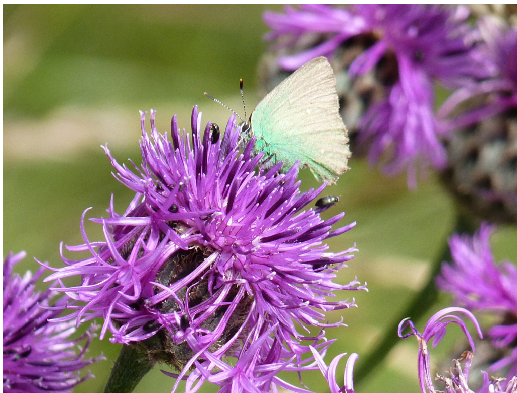
Green Hairstreak