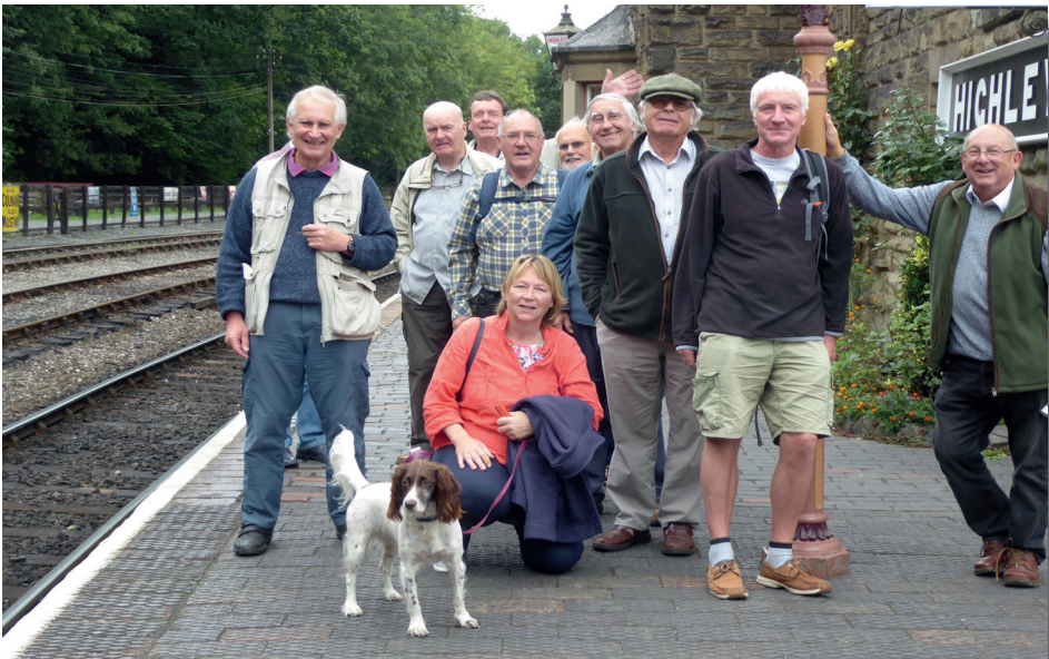
Group members, with Peanut the spaniel, at Highley Station on their Severn Valley Railway trip at the end of August.