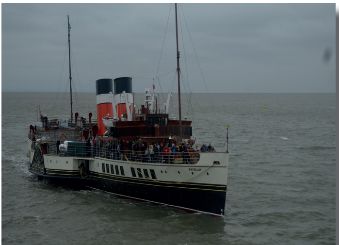
Group members sailing on the Waverley