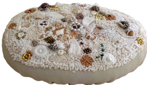
Examples of work by the Patchwork and Needle Skills Group