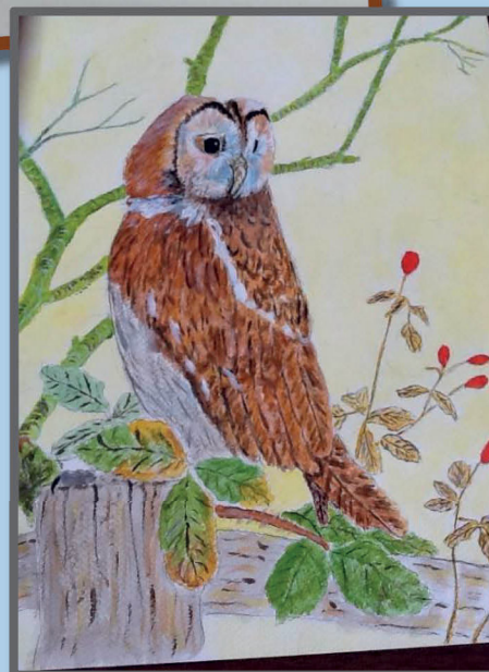
Work by members of Painting 2 Group