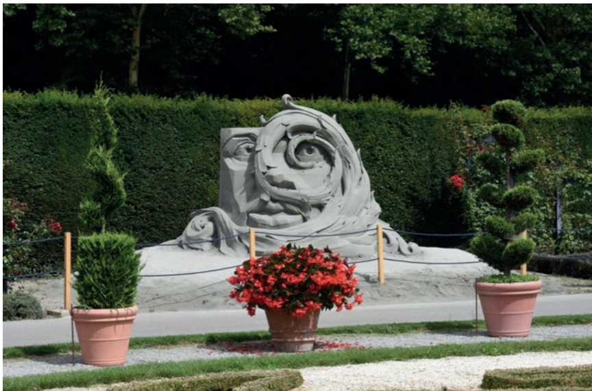
Spiral theme, Sand Art, Ludswigburg, Allan Colwill, Camera Group

Also bring ample money to cover cost of entrance, refreshments and petrol REFRESHMENTS WILL BE AVAILABLE AT ALL VENUES