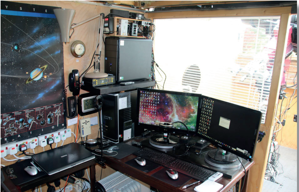
The control room in Chris Baddiley's observatory

The Astrophysics and Astronomy course finished just before Easter. I am most grateful to everyone who attended for making it such a good and stimulating year. Topics covered during the year were solar and stellar evolution physics, the dynamics of the Milky Way and other galaxies, and we spent much time on instrumentation, atomic theory, the four forces of nature, particle and nuclear physics etc and the nature of quantum reality. The study of geometry of space-time - special and general relativity, the universe in four dimensions, and cosmology... the evolution of the universe - came later in the year.