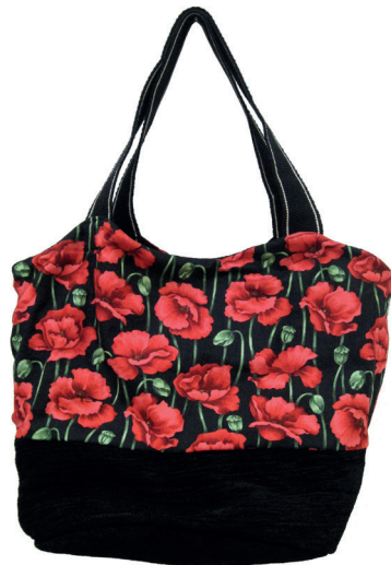
Examples of work from the Patchwork and Needle Skills Group