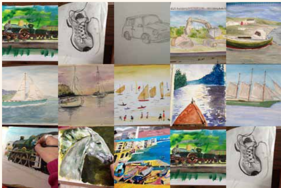
Images from Painting Group 2