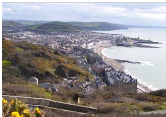
Aberystwyth from Constitution Hill, and ... ... looking towards the Hill and the 'bar'.