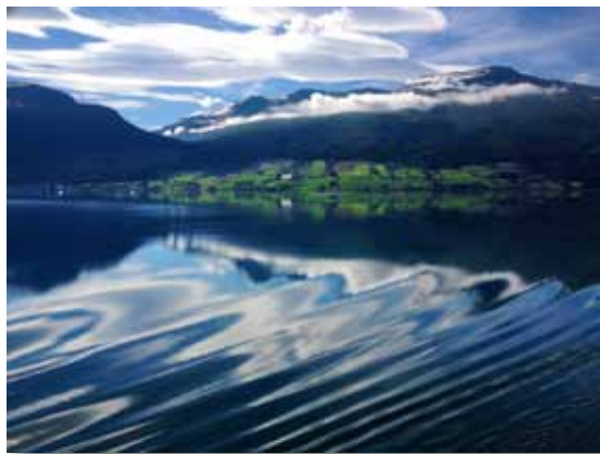
Neil Storey - Wave