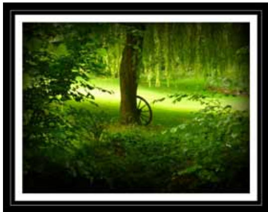
Lorna Blackwell - Green

Themes for members pictures this year have included Green, Wave, Relax and The Old & the New. The theme for May is 'Pattern'. In May we will look at 'Landscape Photography', (with a particular look at stacked and stitched images), and in June it will be 'Some projects for the Summer'.