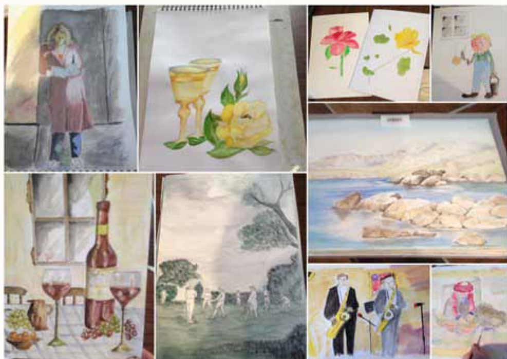
Recent work from the Painting 2 group