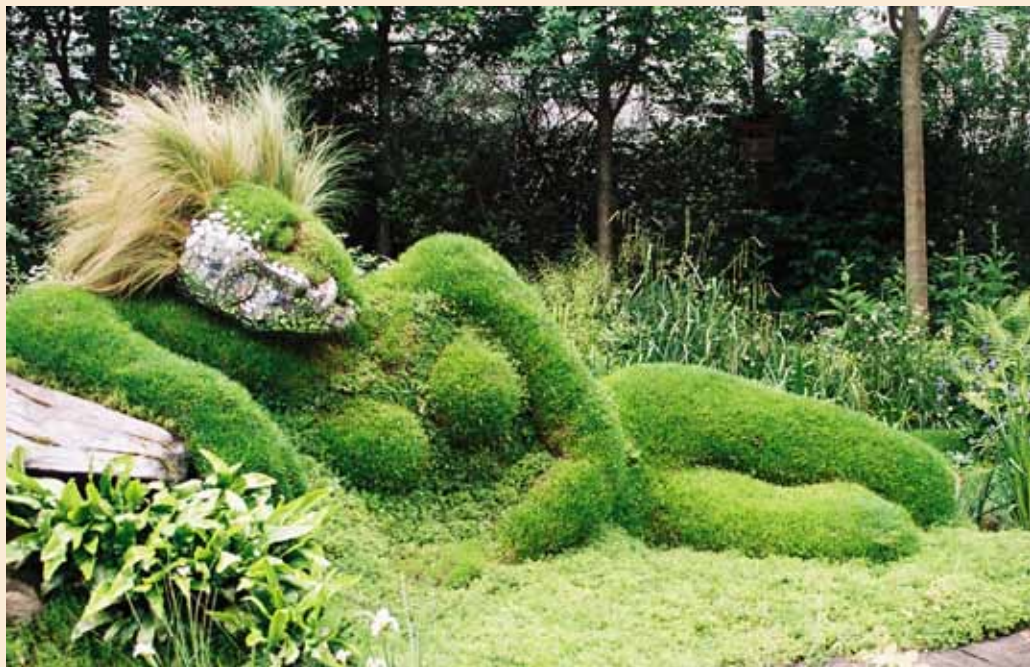
Sue Kershaw - Camera Group theme 'Green'