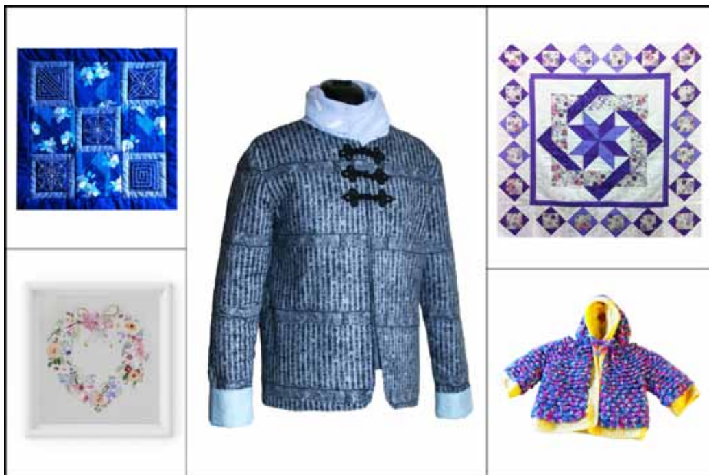
Recent work from the Needlework and Patchwork Skills group