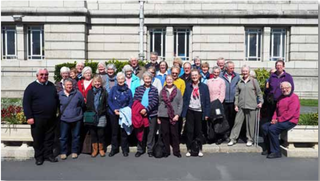
The group outside the National Library of Wales

was opened in 1902 to carry iron ore, timber and passengers. It runs between Aberystwyth and Devil's Bridge. It climbs nearly 200m in the twelve miles travelled, and passes through stunning scenery, often with red kites and buzzards circulating overhead, which indeed they did on the group's visit. Having spent some time in Devil's Bridge looking at the three-layered bridge and climbing down to the waterfalls, we returned to Aberystwyth to visit the National Library of Wales. The visit started with a short introductory film followed by a tour of some of the Library's oldest acquisitions, such as The Black Book of Carmarthen, a compilation of myths and legends of early Wales. Everyone was amazed at the amount of information stored in the Library, which includes a copy of every publication in the UK.