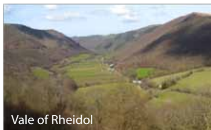
Vale of Rheidol

Wednesday was another glorious morning when the group took a trip on the "Prince of Wales" steam train on the Vale of Rheidol railway, the only narrow-gauge railway to have been owned by British Rail, but is now in private ownership. It