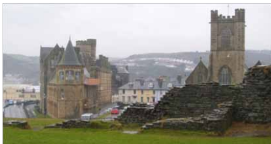
Aberystwyth and the old university from the castle

Tuesday was a much better day with wall-to-wall sunshine and the group travelled south to the pretty seaport of Aberaeron where most of the group watched as a crane lowered