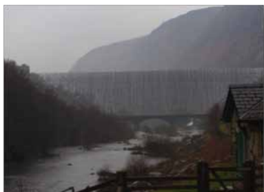
The Elan Valley Dam

On Monday 11 th April thirty-one people set off for Aberystwyth in driving rain which got steadily worse as the day progressed. A stop was made at the Elan Valley Visitor Centre. The dams are operated by Dwr Cymru (Welsh Water) and the centre overlooks the Victorian stone dam which holds the domestic water for Birmingham. The party then continued on to the university town of Aberystwyth where they booked into the Belle Vue Royal Hotel, with the rest of the day free to explore the town.