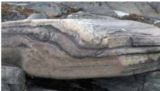
and to fill the space! Layered metamorphic rock at Ardchiavaig, Mull