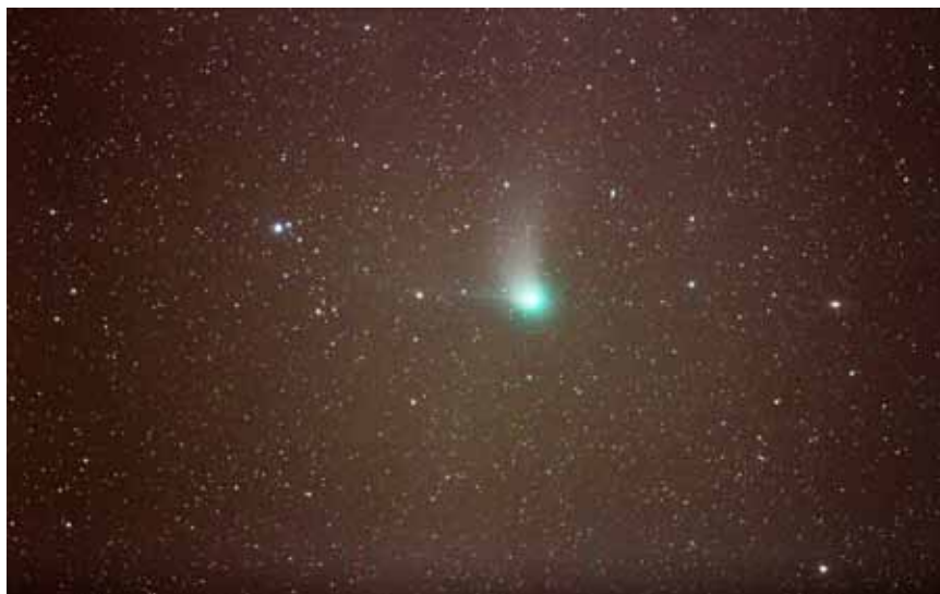
A picture of the recent two-tailed comet Catalina.