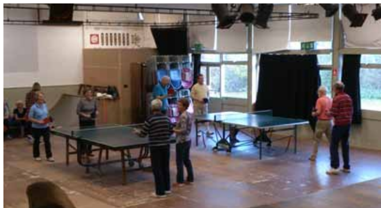
Table Tennis at The Cube

There are now four good quality tables available for members.