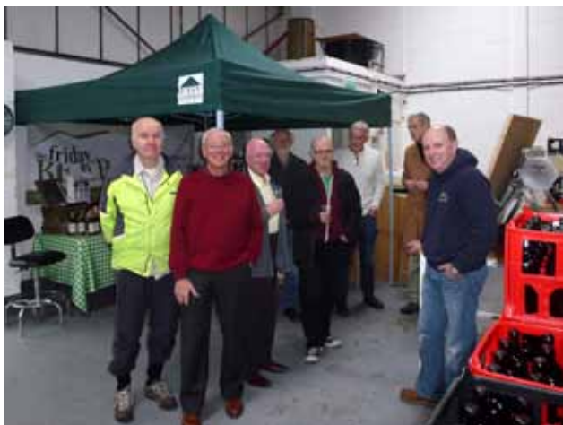
The beer group enjoying a guided visit and beer tasting at the Friday Beer Co brewing, Malvern.

The newly formed U3A beer group beer started after registration day in September, modelling itself on the successful wine sampling Grape Group. We have around 20 registered members, but would welcome more. Events to date have included bottled beer sampling, pub visits and a brewery trip. Our aim to develop knowledge and experience of good beer by mixing theory and tasting in convivial company.