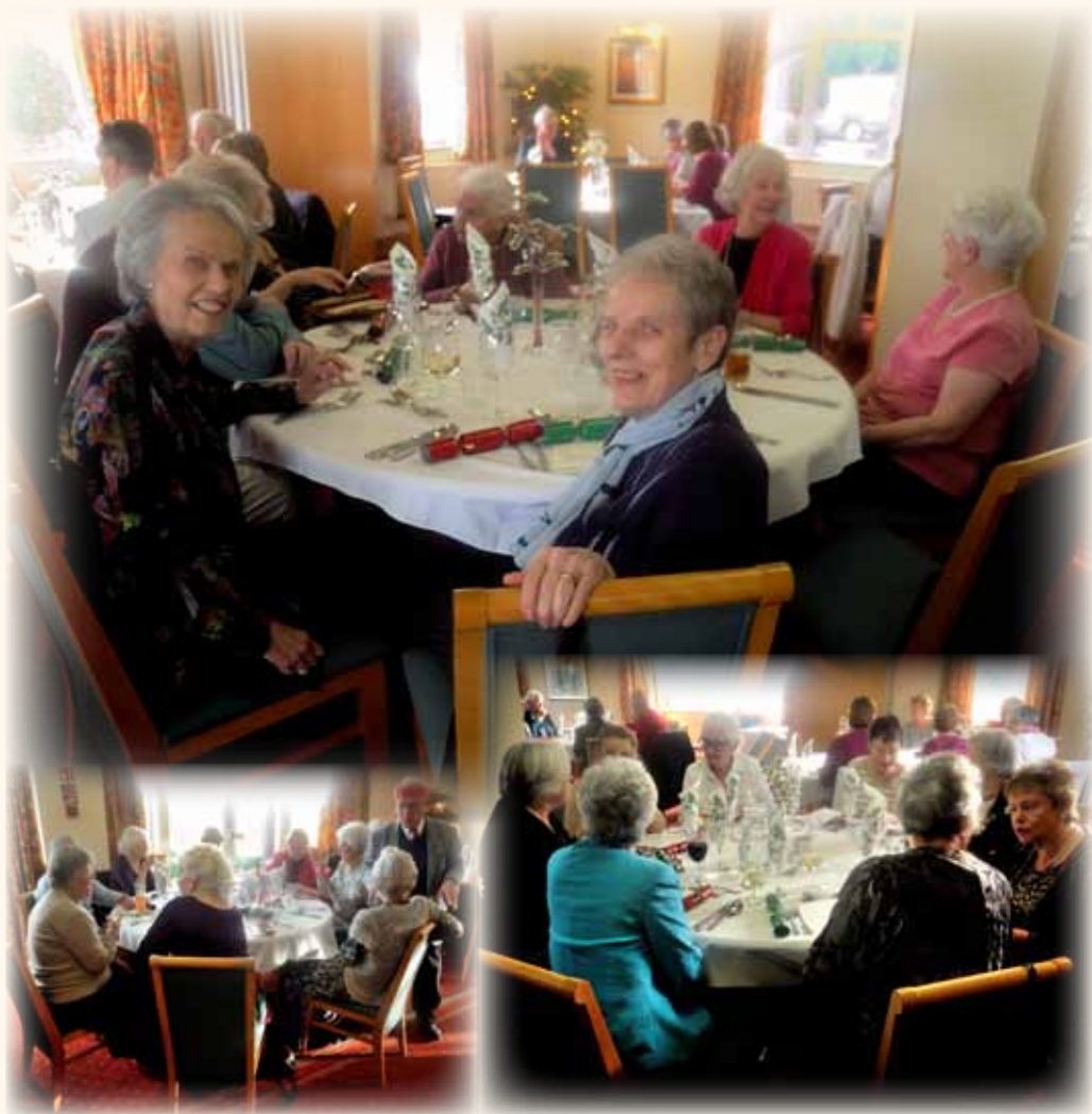
Christmas Lunch - 12 th December 2014