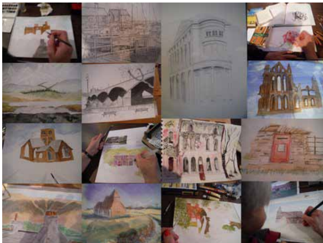
'Buildings' by members of the Painting 2 Group