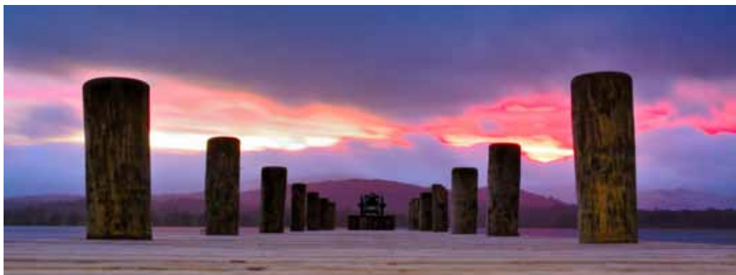
Low Wood jetty - Lake Windermere