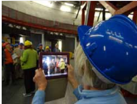
Inside the world's largest telescope

At just over 2400 metres high, La Palma is not only steep but quite difficult to get around. With over 200 bends to negotiate, it is quite a slow journey to the very top. The Canarian houses gradually become more spaced out as the forest thickens and then we ascend into cloud and rain. After just a few minutes, the