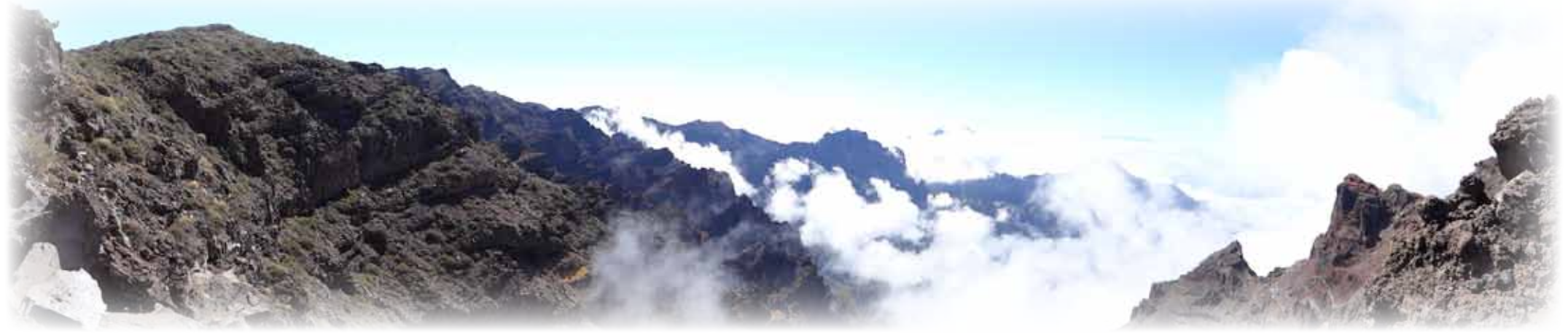
Las Palma panoramas - Geoffrey Carver

Day two saw us visiting the National Park at Cumbreceita where the brilliant sunshine revealed a beautiful panorama of fragrant pine trees and a different sequence of younger volcanic rocks, although younger here probably means about 750 000 years old. Even we geologists were impressed by the gentle ambience of this beautiful place. The two hours allocated to us by the Park Authority passed far too quickly.