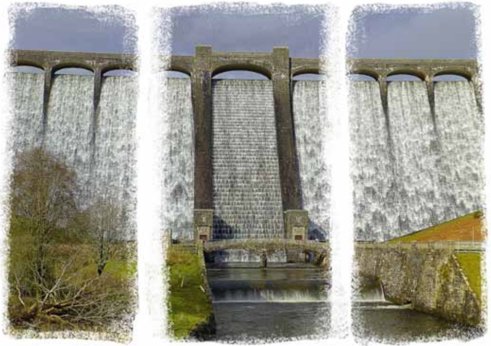
Lorna Blackwell - Elan Valley