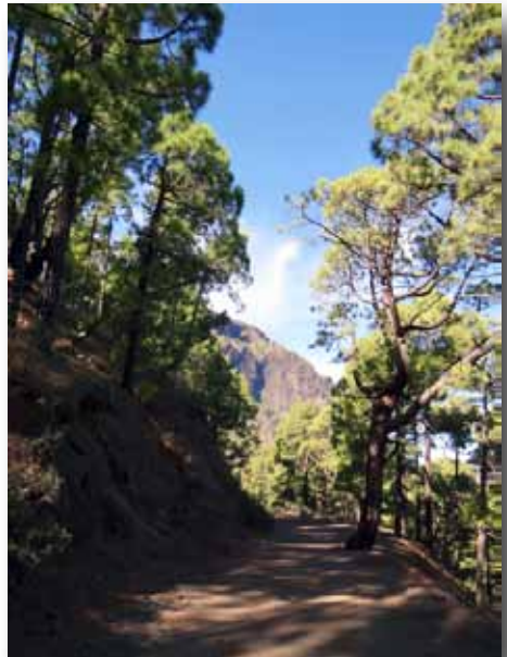
Cumbrecita National Park

A remarkable collection of multi-coloured buildings, some dating back to the 16 th Century. Since this is a small island, we managed to cover much of it in our week's stay. For the first three days we centred our exploration around the spectacular Taburiente crater. After looking at a huge scarred landscape where 3 000 000 000 000 tons of rock collapsed into the Atlantic creating giant tsunami waves, we walked along a deeply incised valley into the ancient volcanic core of the island, small cries of delight accompanying each discovery. This was the text book brought vividly to life.