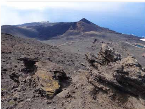
Volcan Teneguia – just a youngster at 43

Teneguia volcano erupted with relatively little warning and for less than a month, but produced a remarkably large amount of lava. Two people were killed by the eruption – both being asphyxiated by the gases driving the spectacular lava fountains. So it was only to be expected that our leader would set us the task of finding the fumeroles from which these same toxic gases still arise!